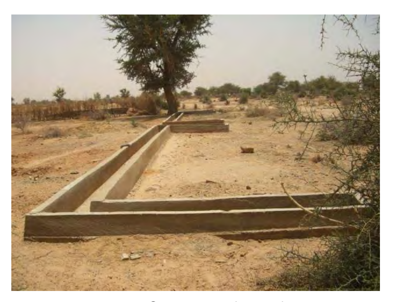
Soumatte cattle trough underconstruction